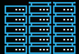
MOUNTAINS OF DATA

Organizations are clamoring for faster, more efficient, and more affordable ways to consume, process, and extract useful insights from the mountains of data they deal with every day. And the amount of data out there is not only growing—it's constantly evolving. Intel® Optane™ technology brings access to much more data closer to the CPU. This means faster computing of real-time analytics, financial transactions, flight reservations, and other use cases that require predictably fast read-response times—when averaged response times are not good enough.